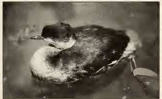
Black-necked Grebe Podiceps nigricollis, Roche Caiman, Seychelles, December 1993

Vagrant. One record: Dec. South-east Island/Mahé (1).